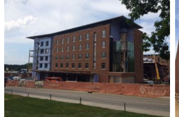
South – Bldg. A