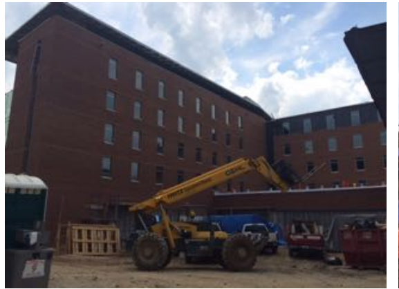
North East - Bldg. A