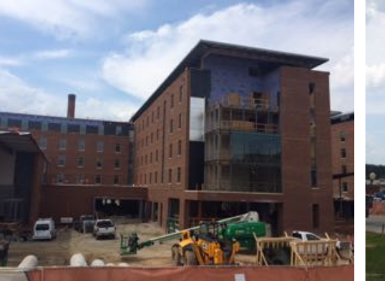
South East - Bldg. C