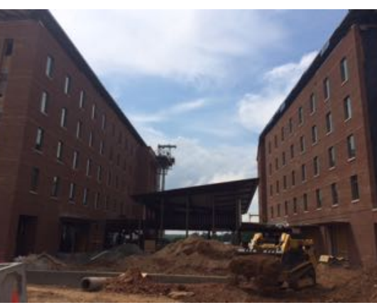
East – Great Hall