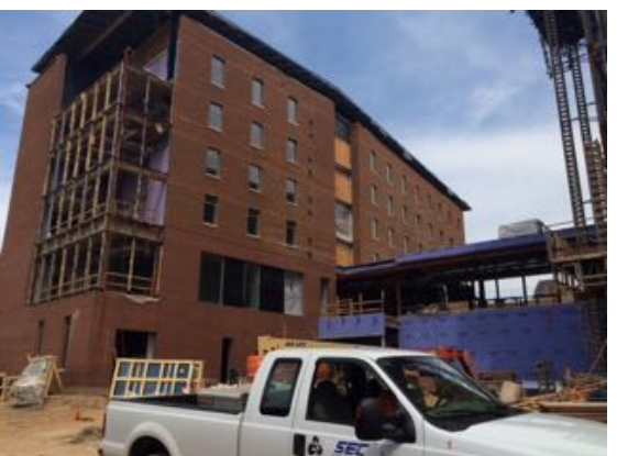
South West - Bldg. D