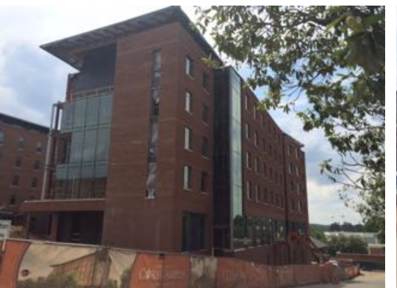
North East - Bldg. D