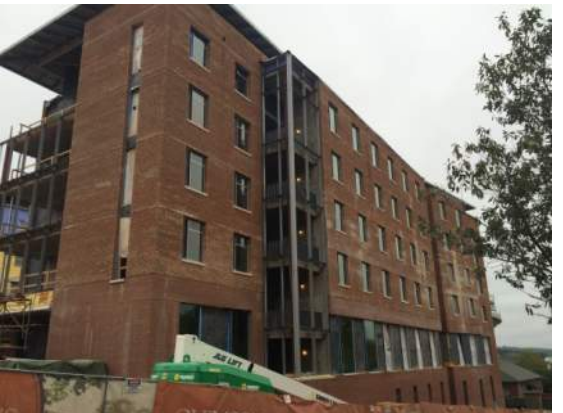
North East - Bldg. D