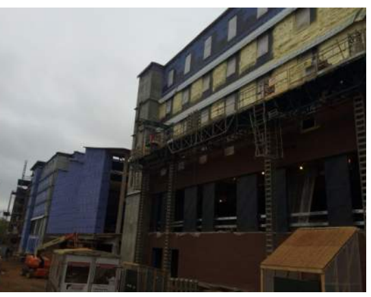
West - Bldg. A, B, & C