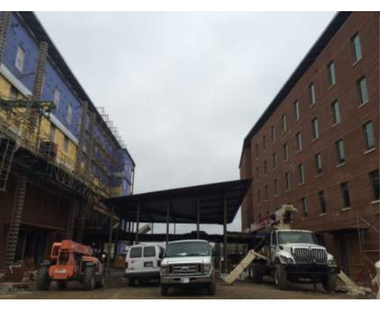
East – Great Hall