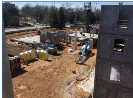
Bldg. E Precast Sequence 2