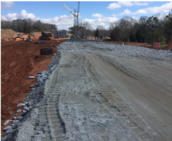
Crane Roads at West Zone