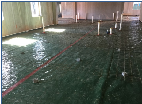
Bldg. G Slab on Grade Prep