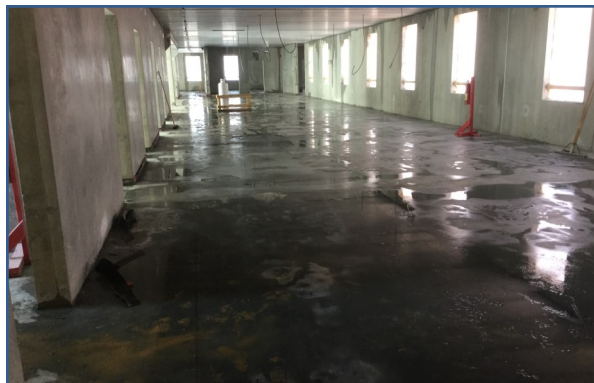
Building F 2nd Floor Topping Slab