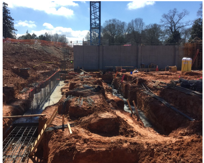
HUB Walls and Grade Beams