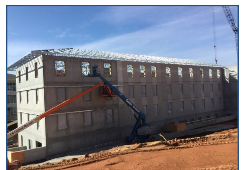
Bldg. F Trusses