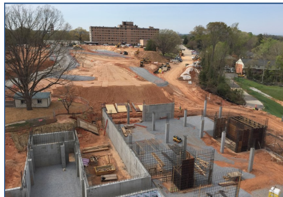
Columns and CIP Walls @ HUB