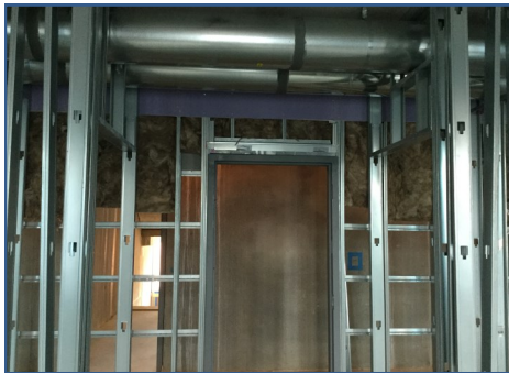
Bldg. G Hanger Duct