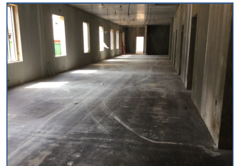
Bldg. F SOG