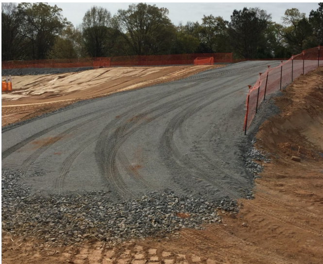
Access Road @ Building B