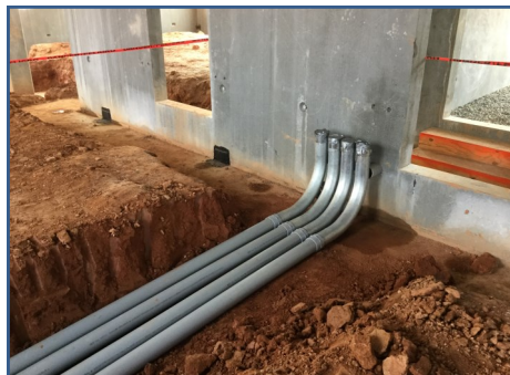
Bldg. E Electrical Stub Ups