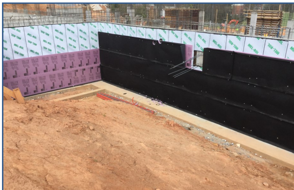
Waterproofing @ HUB Walls