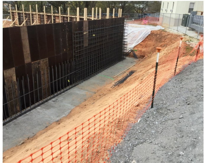
Building A Wall Forms