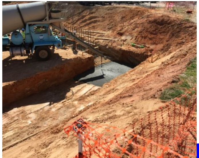
Building A Foundations