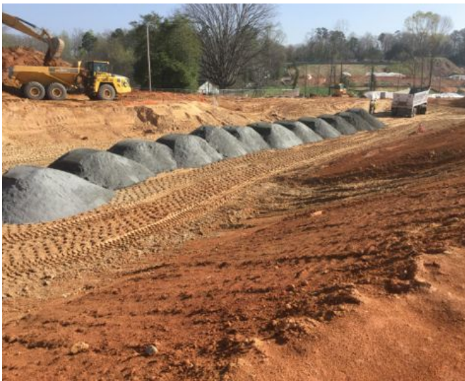
Backfill @ Building B.