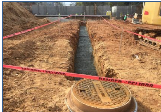
Ductbank North of the HUB