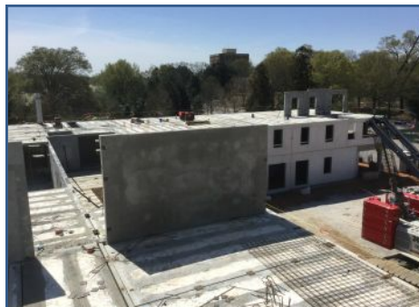
Bldg. E Precast Sequence 2