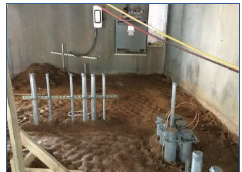
Bldg. F Electrical Stub Ups