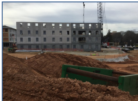
Bldg. E Precast Sequence 1