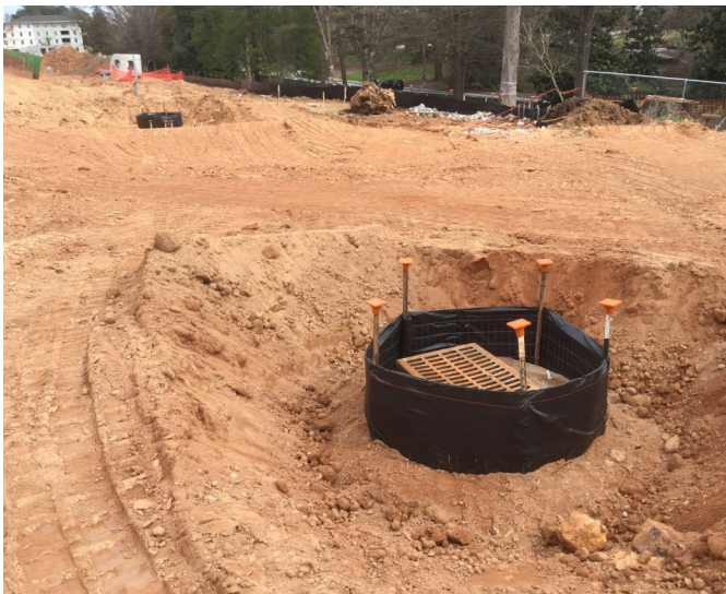
Drop Inlets @ Storm Line 9