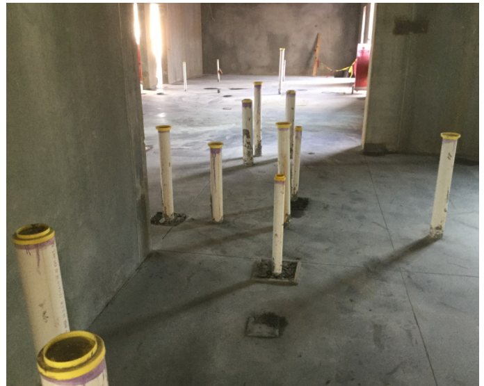
Aboveground Plumbing @ Building G