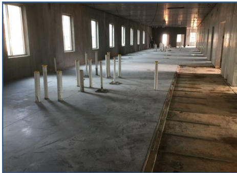
Bldg. G Slab on Grade