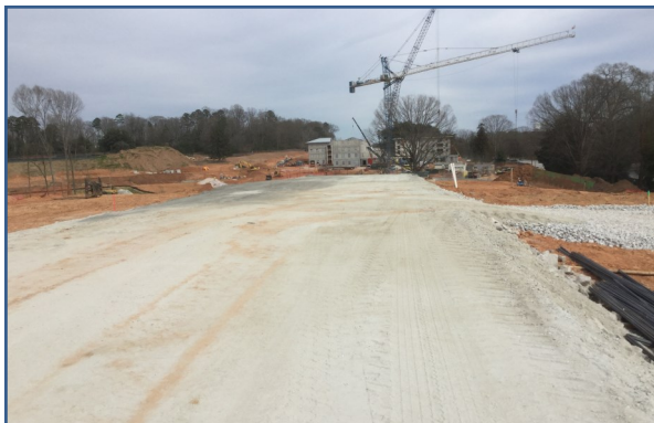
West Zone Crane Roads