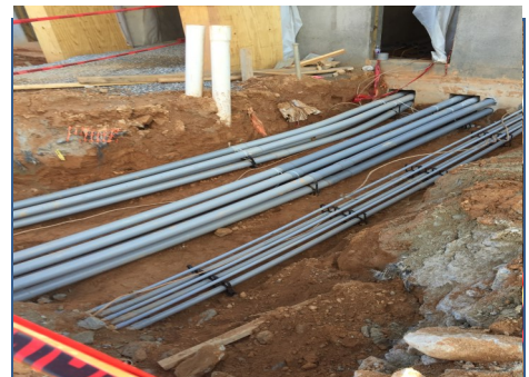
Bldg. F Electrical Tie In