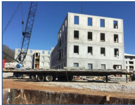
Bldg. E Precast