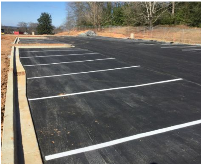
East Parking Lot Striping