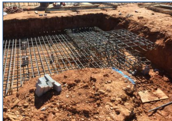
Foundation Reinforcing @ HUB