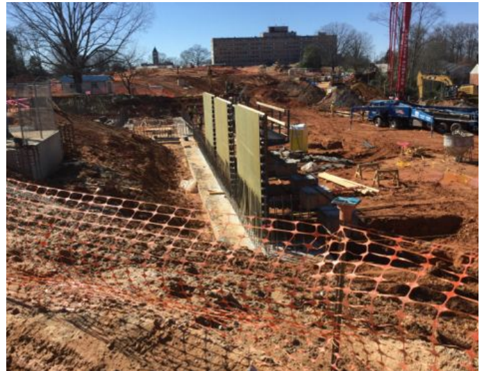
HUB Wall Formation