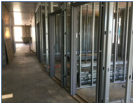
Bldg. G Door Frames