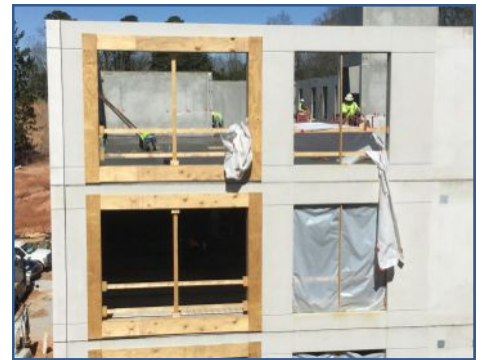
Bldg. F Topping Slab