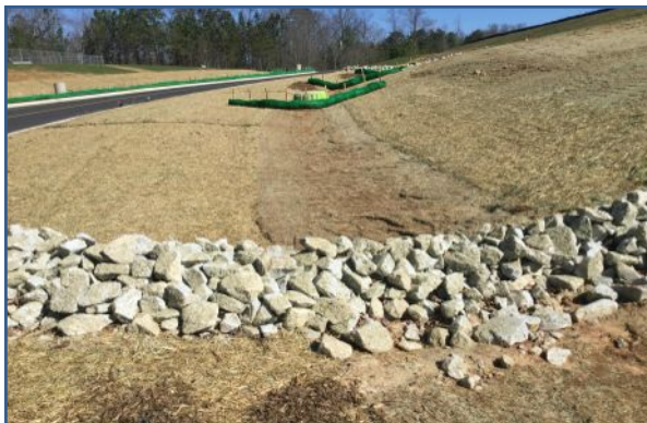
Erosion Control @ Newman Road