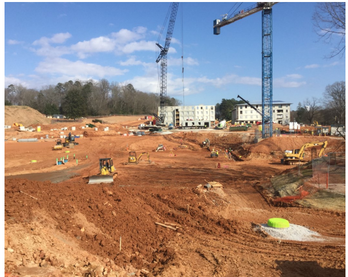
HUB Building Pad Prep