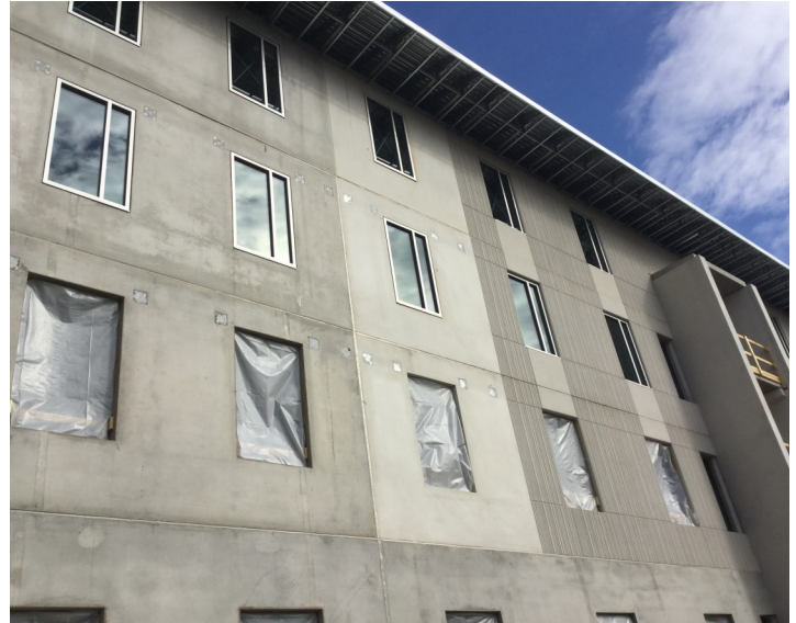
Window Installation @ Building G