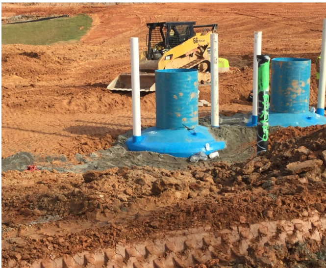
Grease Interceptors @ HUB Utility Yard