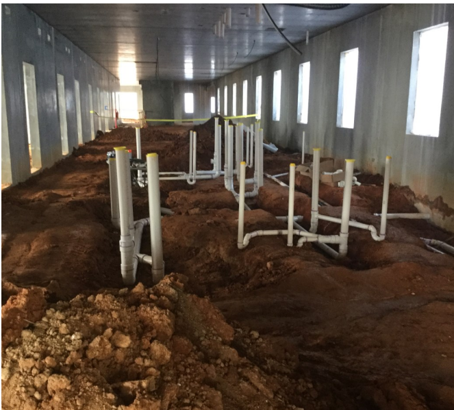
Plumbing Rough-In @ Building G