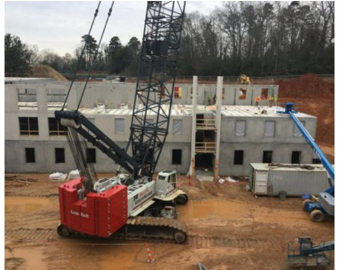
Precast Erection at Building F