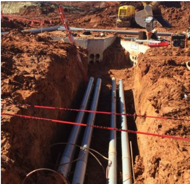
MH6E and MH6C Tie in