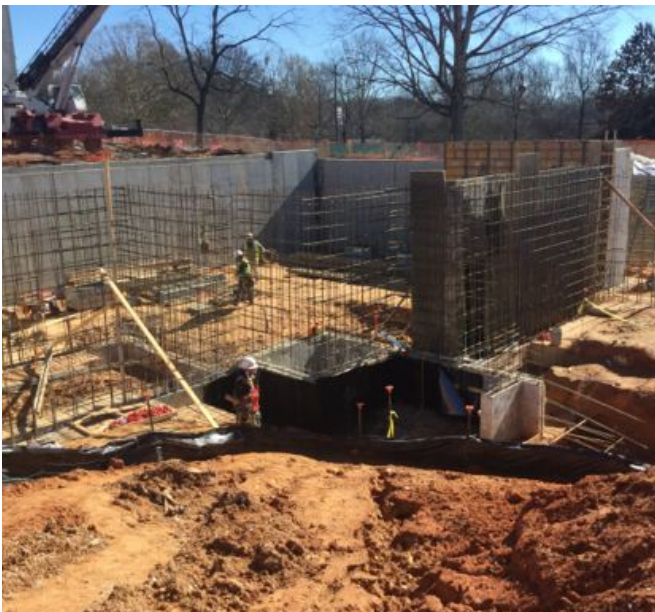
Building E Basement Walls