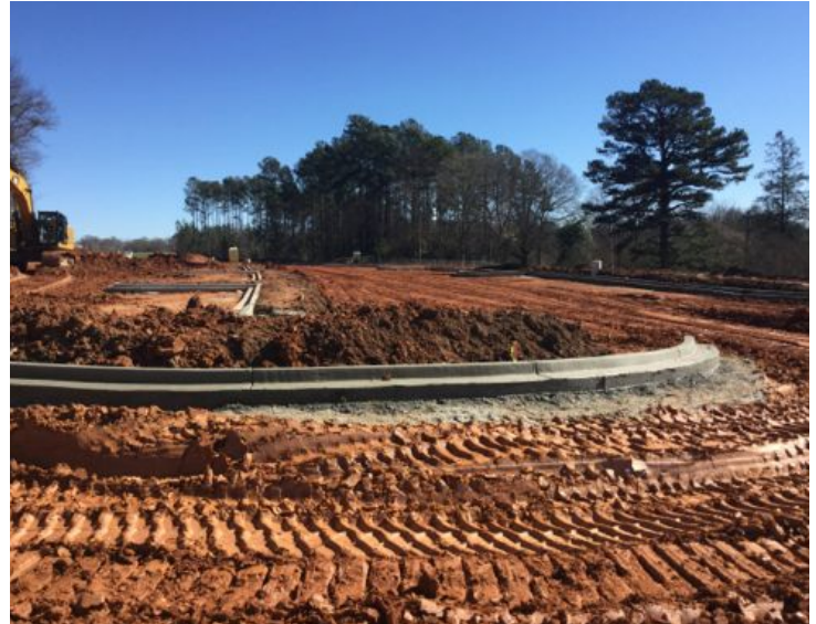
Completed Curb and Gutter @ East Lot