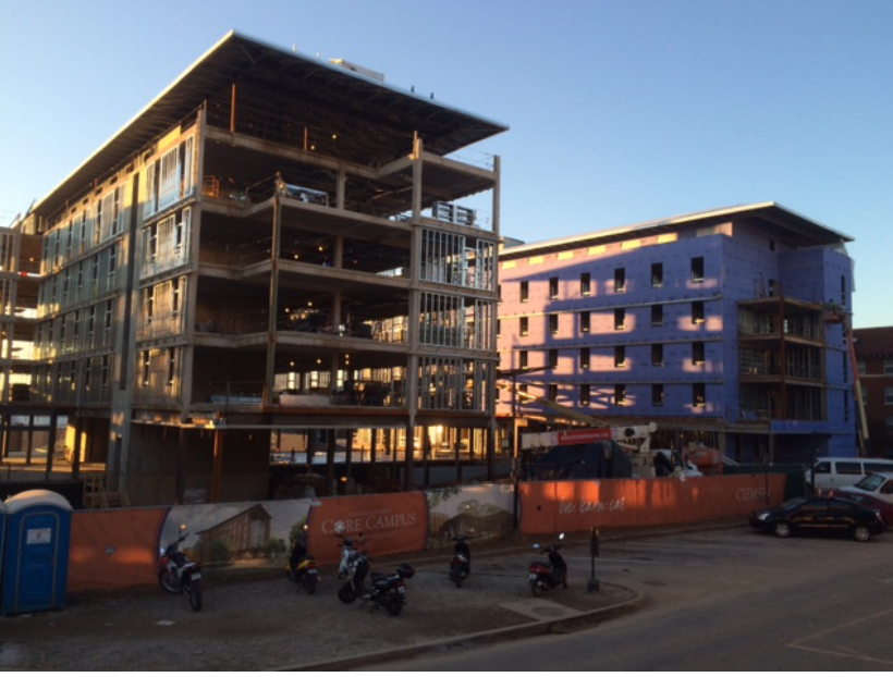
View of Building A & B