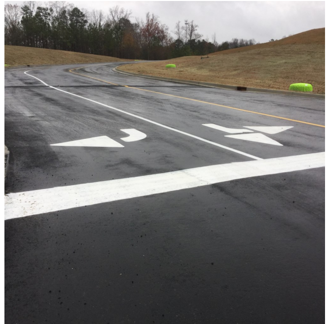
Striping At Newman Road