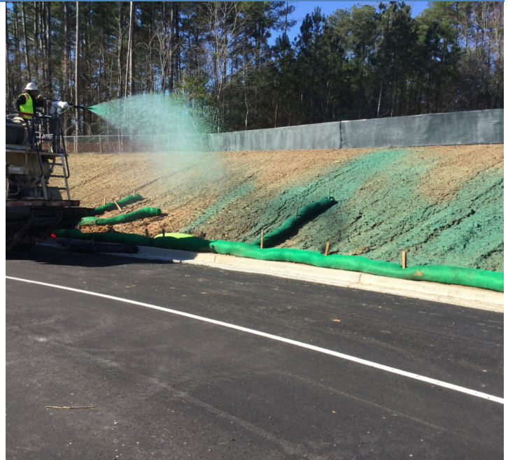
Hydro seeding at Newman Road