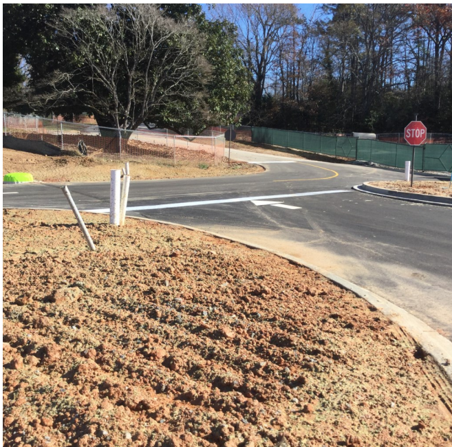
Northeast Parking Lot