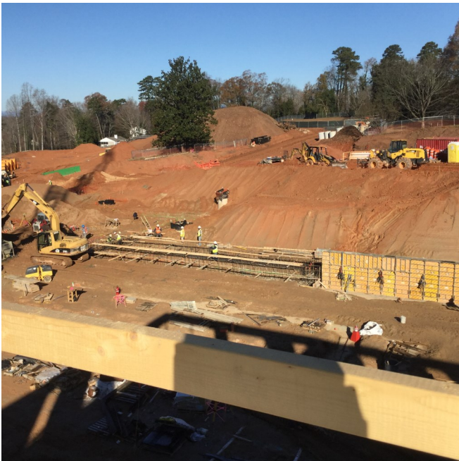
Footings and Stem Walls at Building F