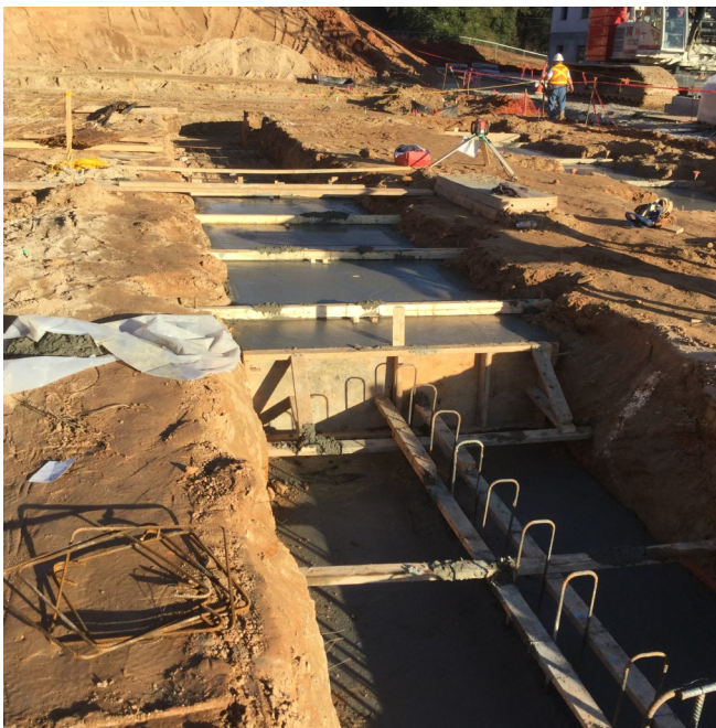
Footings at Building F