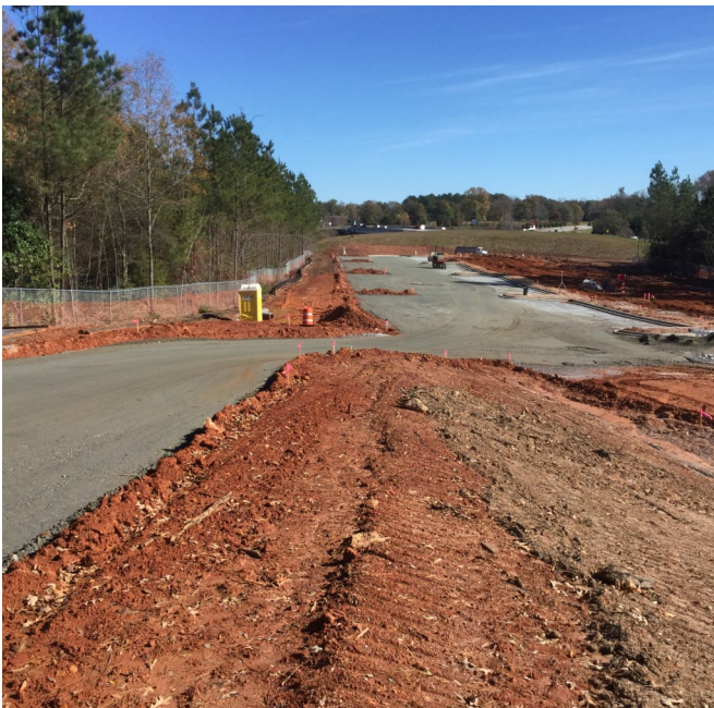
East Lot preparation for paving