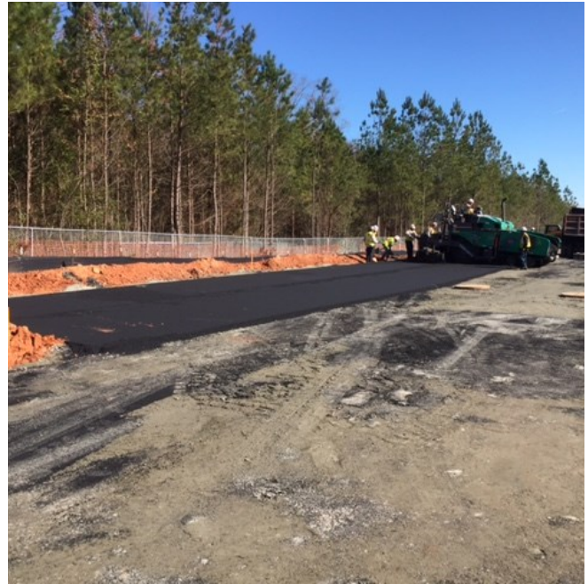
Paving East Lot