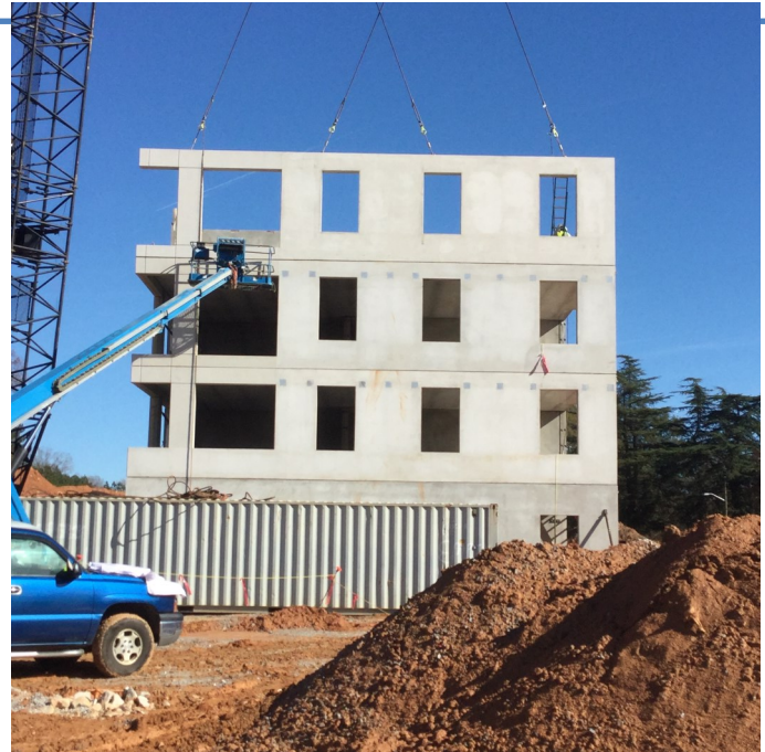
Precast panels at Building G