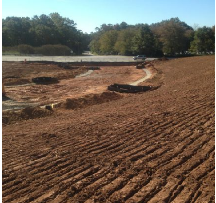
Newman Road preparation and grading.