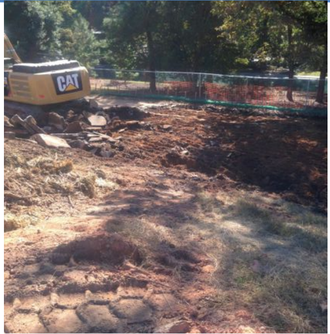
Excavation of West Zone.