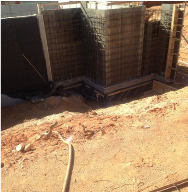
Continued forming basement walls of Building G.