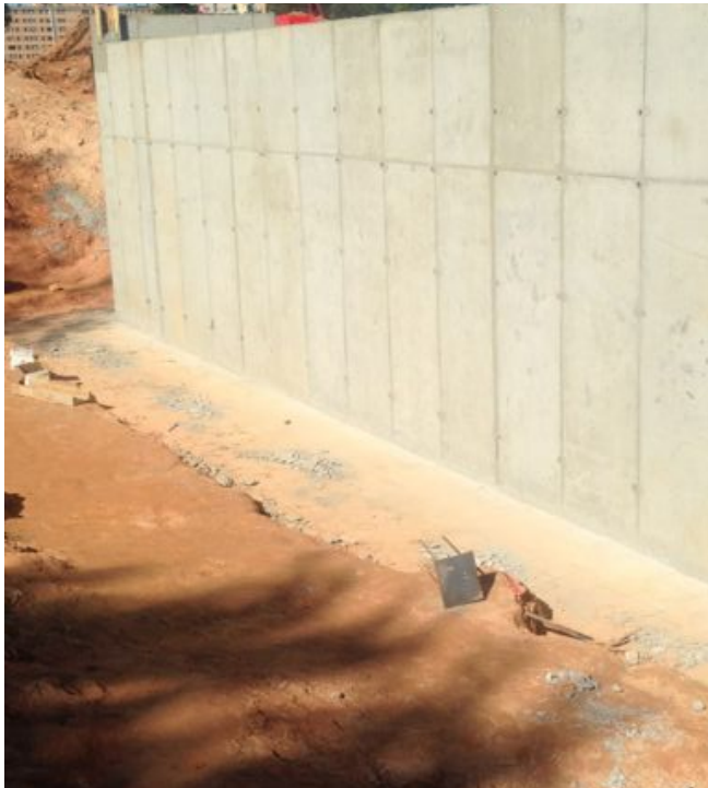
Completed Building G basement south wall.