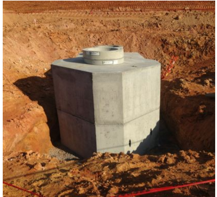
Continued installation of manholes 11 and 12