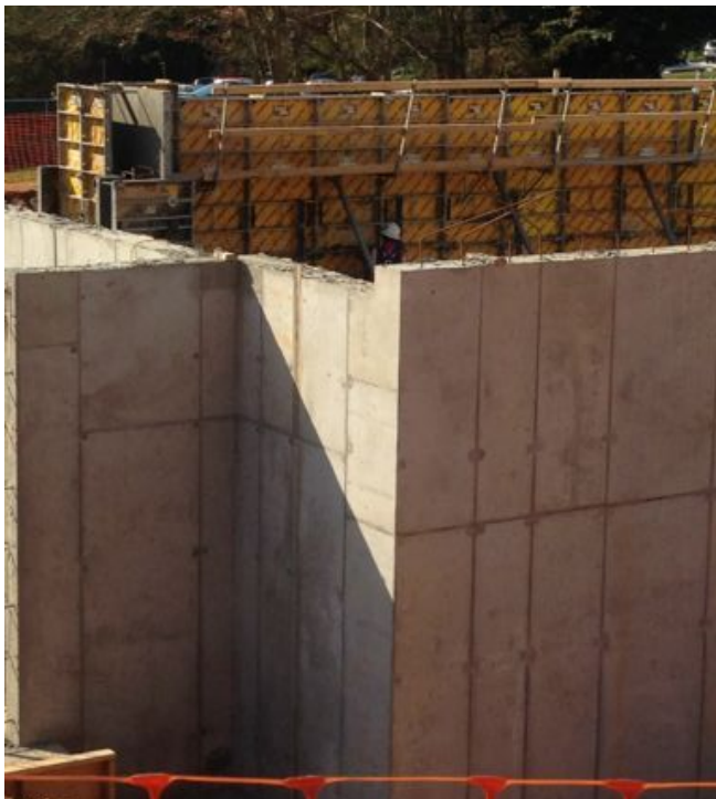
Forming and Pouring of Building G east wall and south wall.