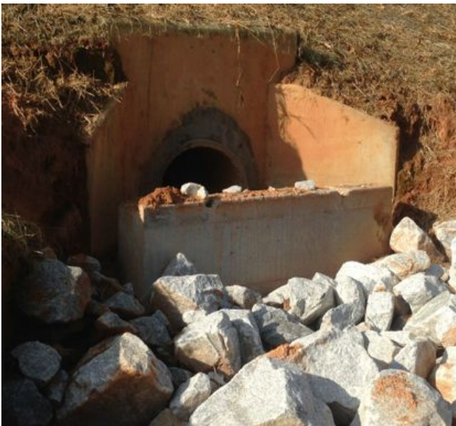
Completed Dissipater at detention pond.