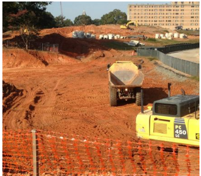
Continued grading on Hub building pad.