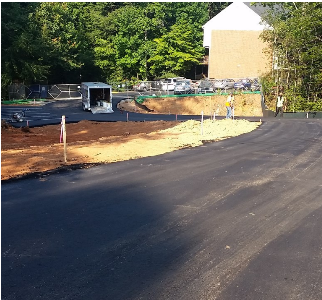
Asphalt Paving and striping at new Daniel Square entrance