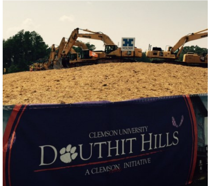
The starting line up.