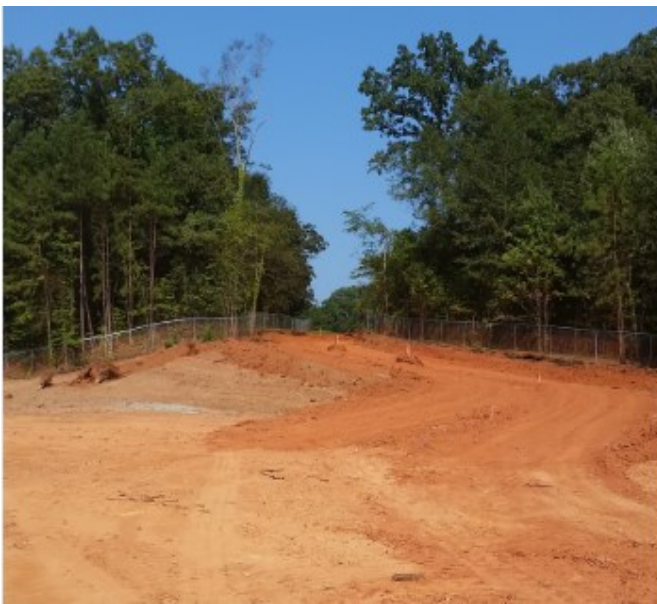
Rough Grading for Newman temporary Rd.