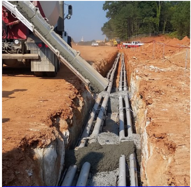
Continue Underground Electrical Conduit