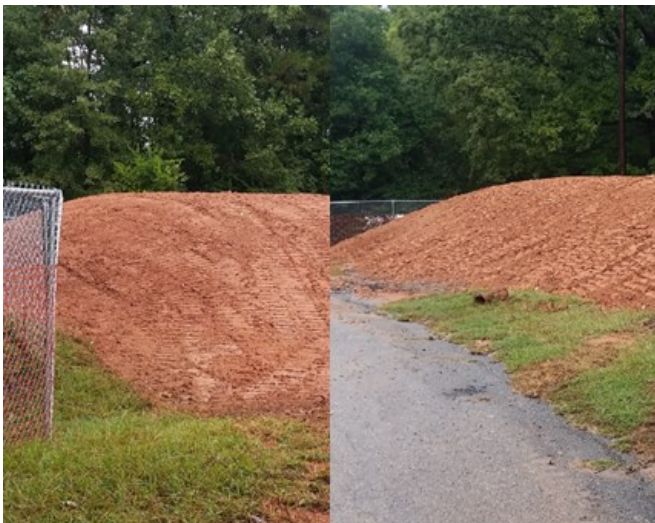
Installed two berms along the North side of the site.