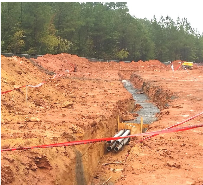
Installation of underground electrical North of East parking lot.