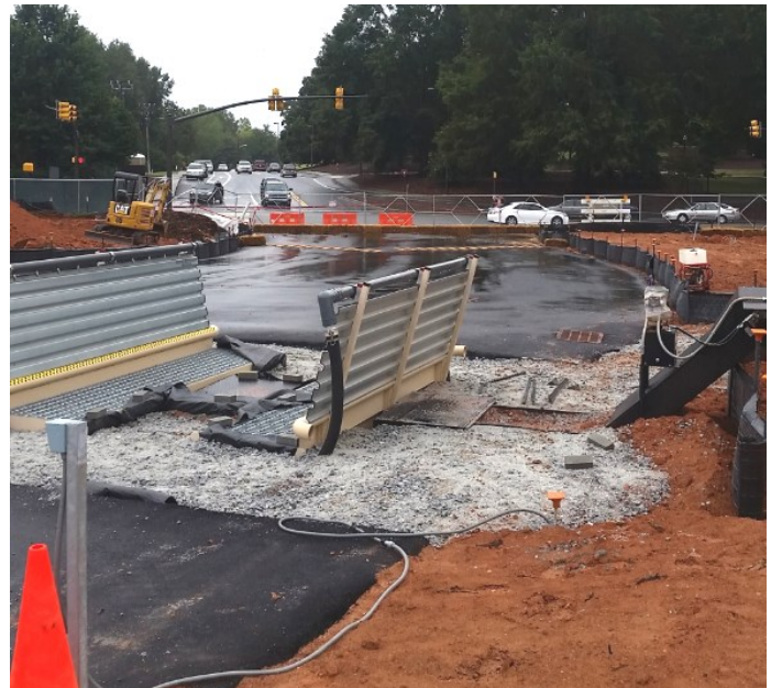
Asphalt paving at construction Gate 1.