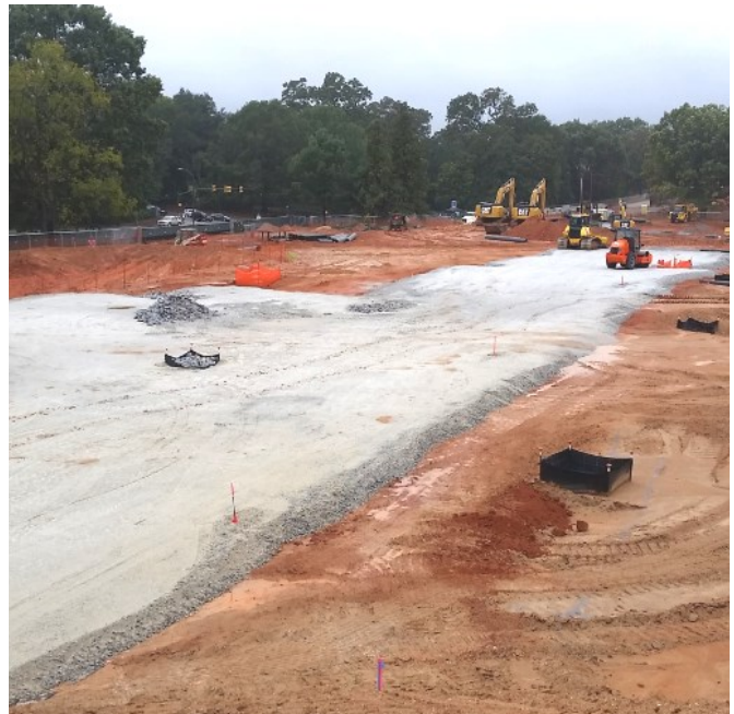
Continued installation of East zone crane and access roads.