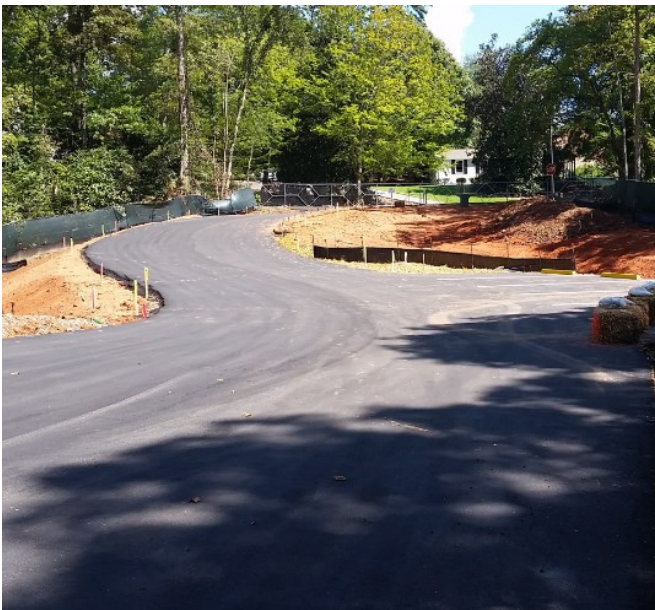
Additional erosion control added at Daniel Square entrance