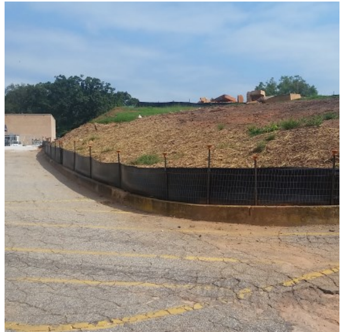
Installation of jobsite erosion control near trailer compound.