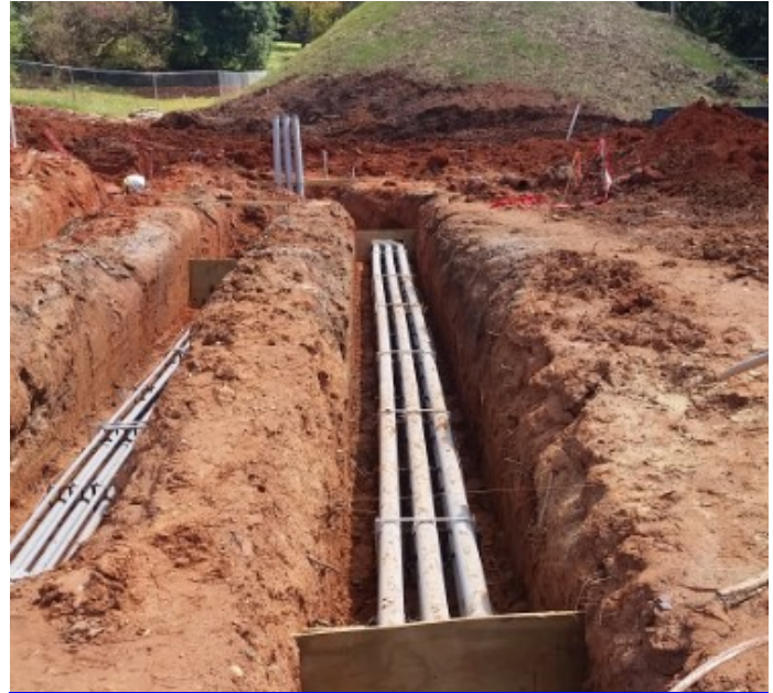
Underground Electrical Conduit near Building G pad.