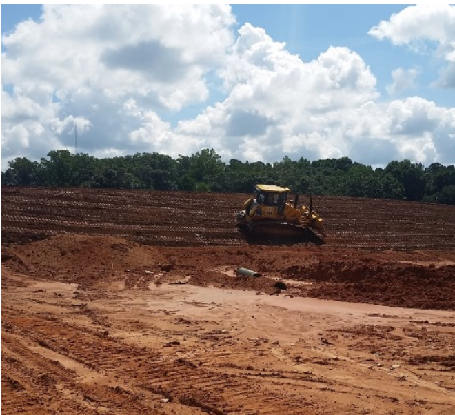
Spreading of top soil on Pecan Grove.