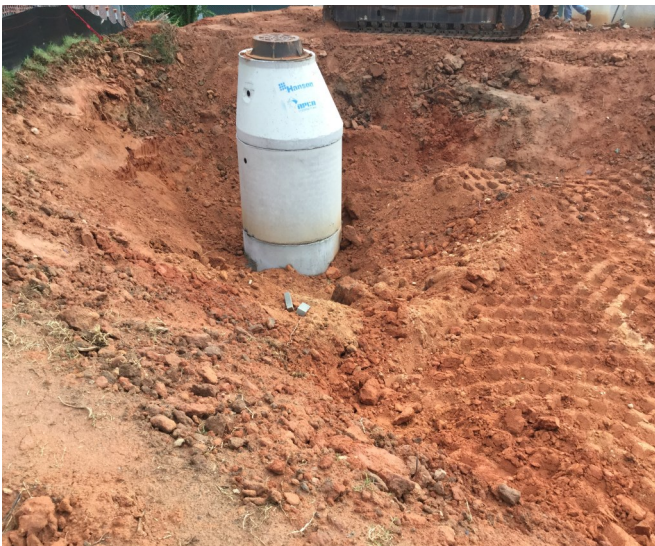
Installed structure #16 on sewer line #2.