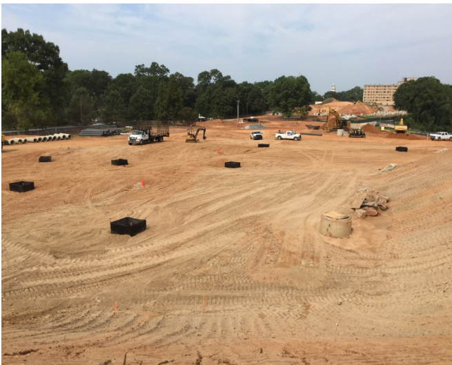
Storm drain inlet protection.