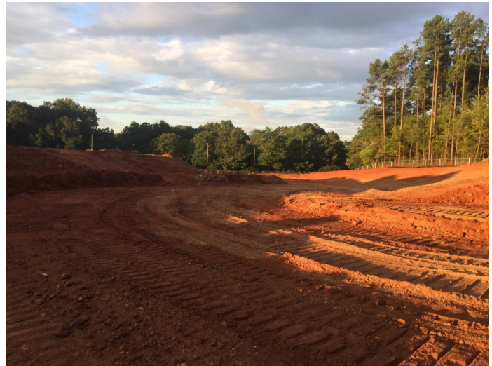
Grading for Newman Rd. entrance.