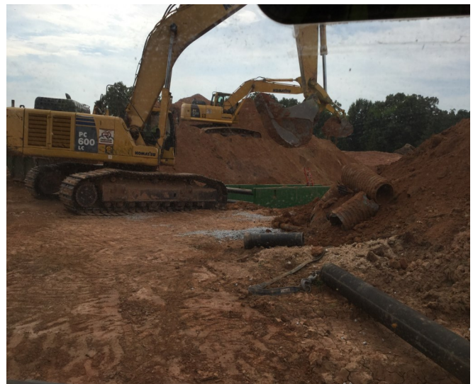
Installing sewer line between structure #16 and #15.