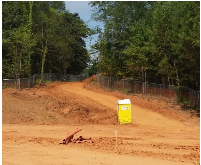
Rough Grading for Newman temporary Rd.