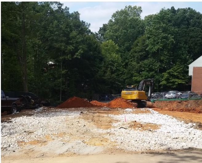
Grading at new Daniel Square entrance