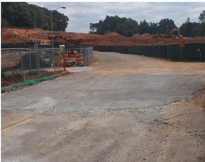
Concrete patching on Daniel Dr.