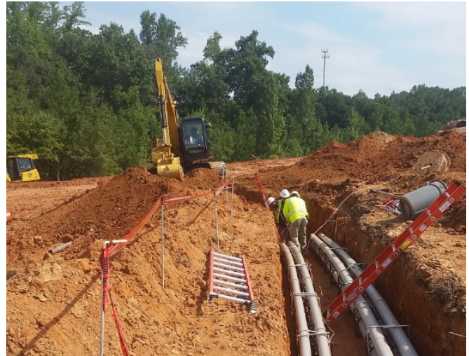
Continue Underground Electrical Conduit