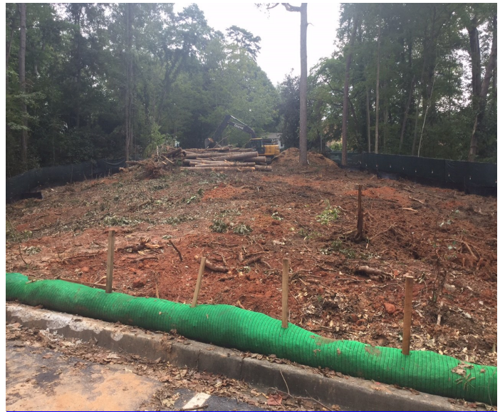
Clearing New Daniel Square entrance