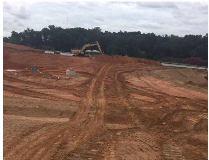
Starting Underground Electrical Conduit