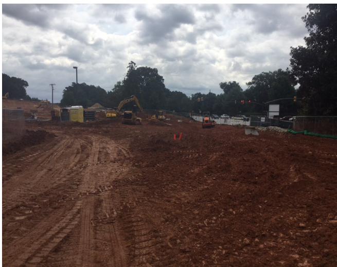
Back filled gate one for construction entrance.