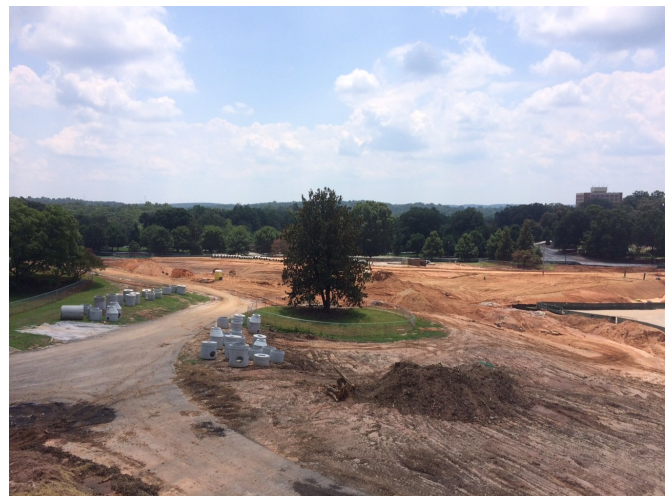
East Area View