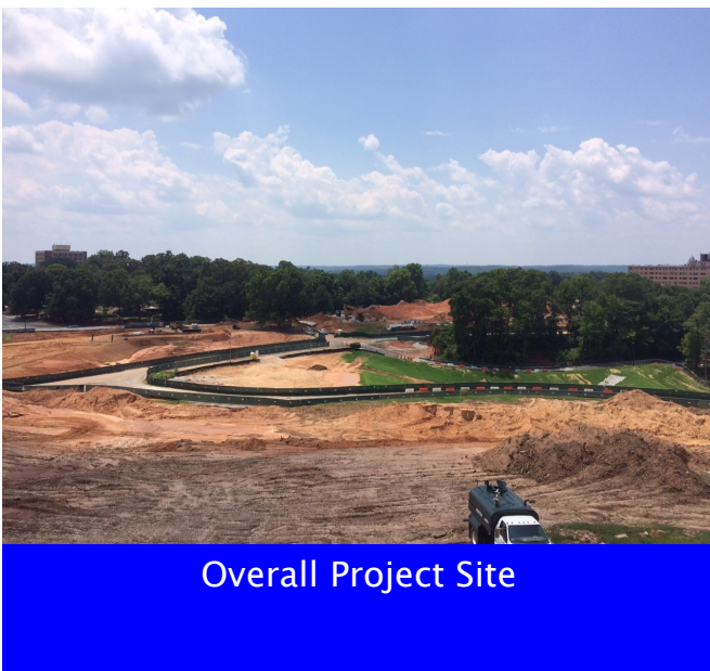
Overall Project Site