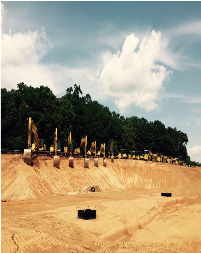
Starting line up!!!