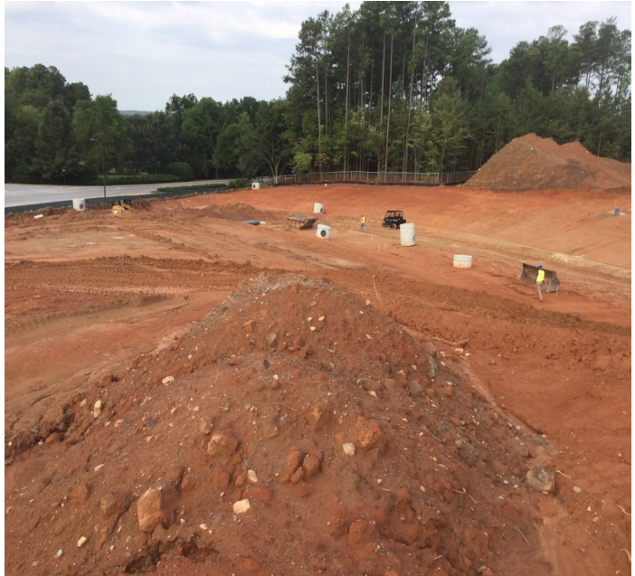
Newman Rd. entrance