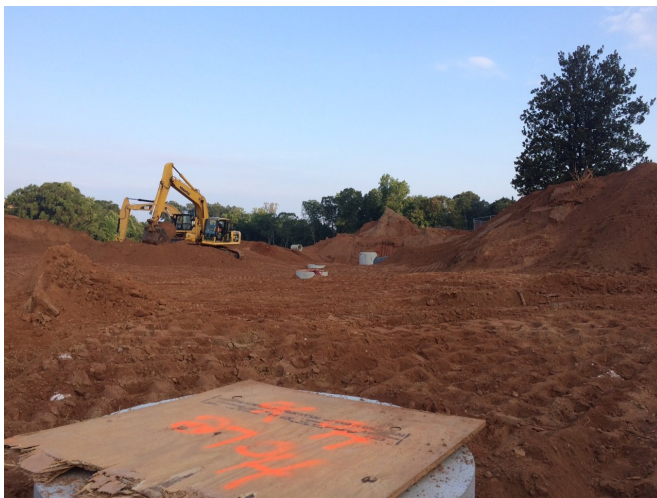
Storm Line #4A install