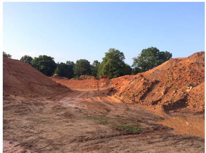
Cut for Sewer Line #2 install Back of Clemson House