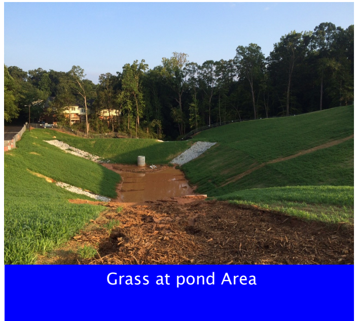
Grass at pond Area