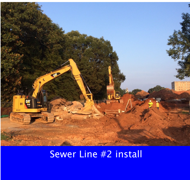
Sewer Line #2 install