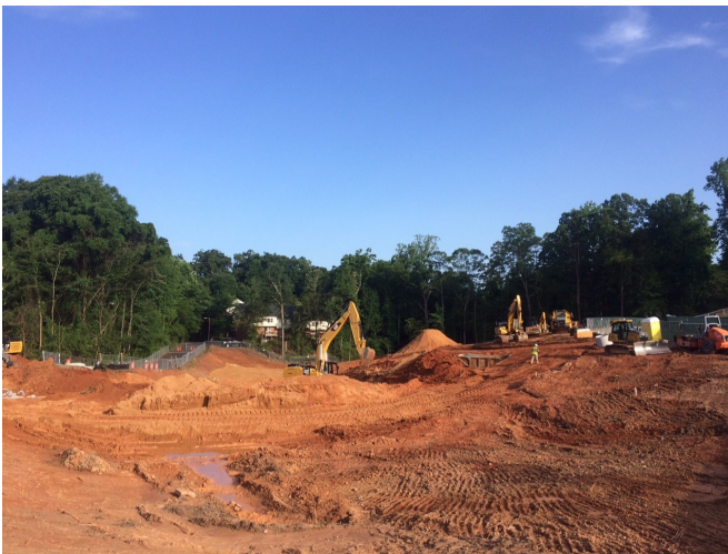
Grading and Storm Drain Install at Pond Location