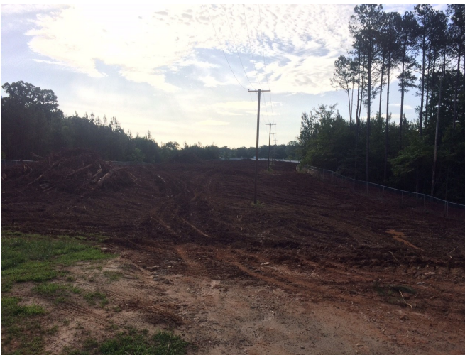
Clearing and Grubbing East