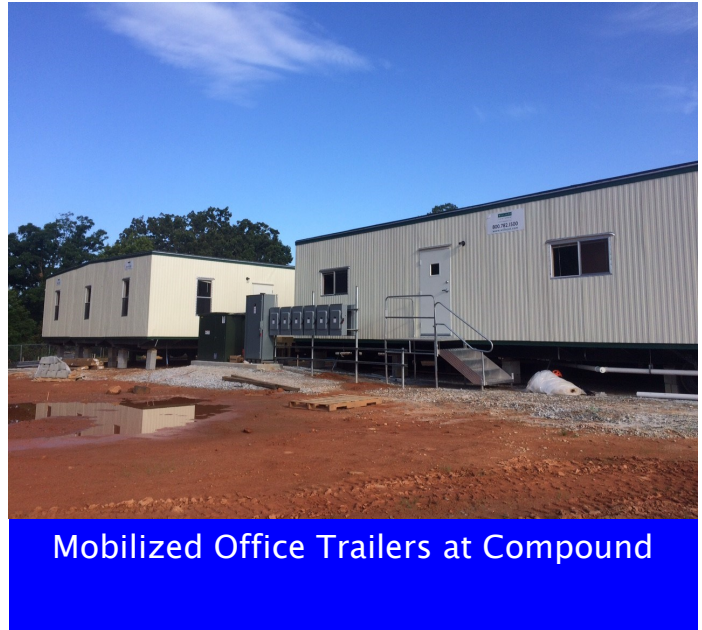
Mobilized Office Trailers at Compound