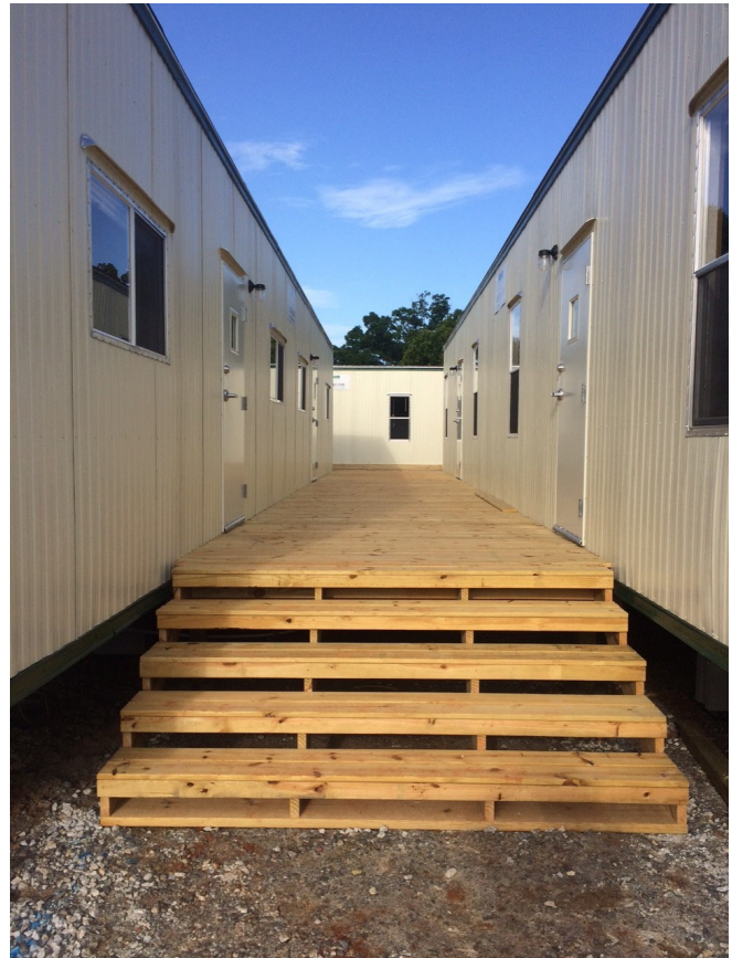
Continued Deck Build-Out for Trailer Compound