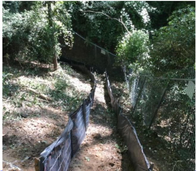
Installation of Silt fence at Detention Pond