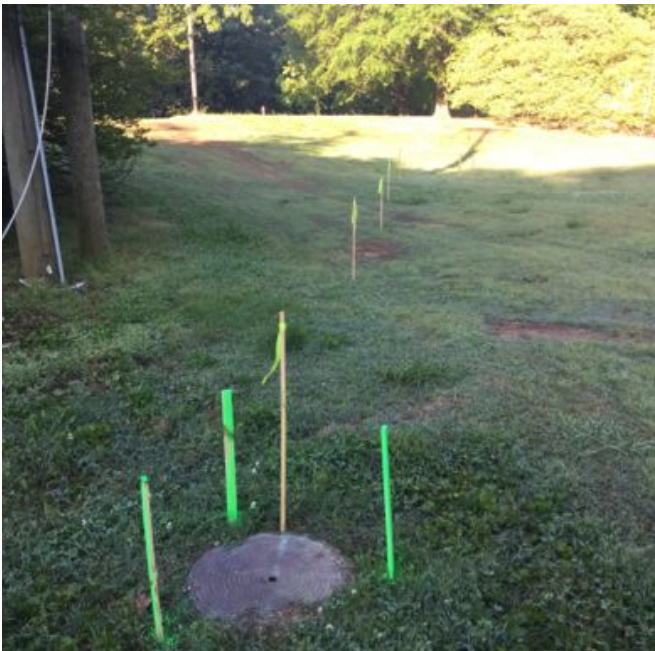
Located Existing Sewer Line