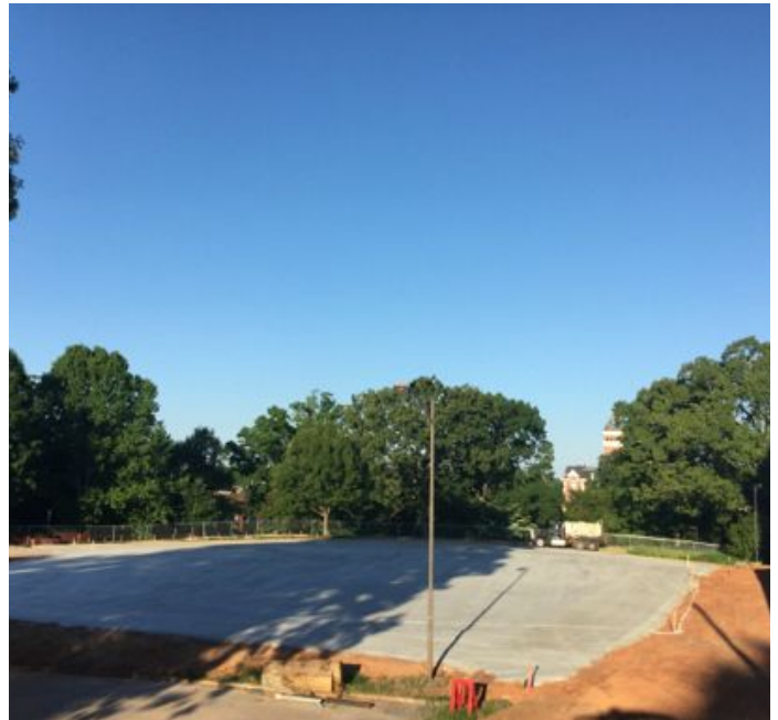
Holder Trailer Compound