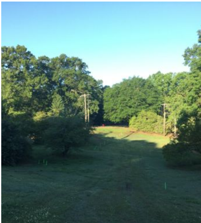
OHP Demolition work