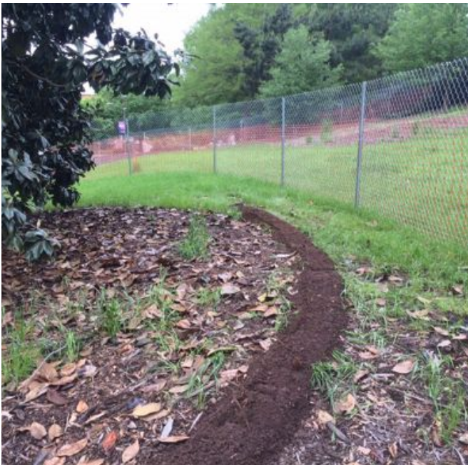
Root Pruning at Tree Protection Areas