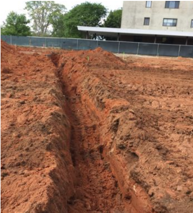
Utility Demo at Trailer Compound