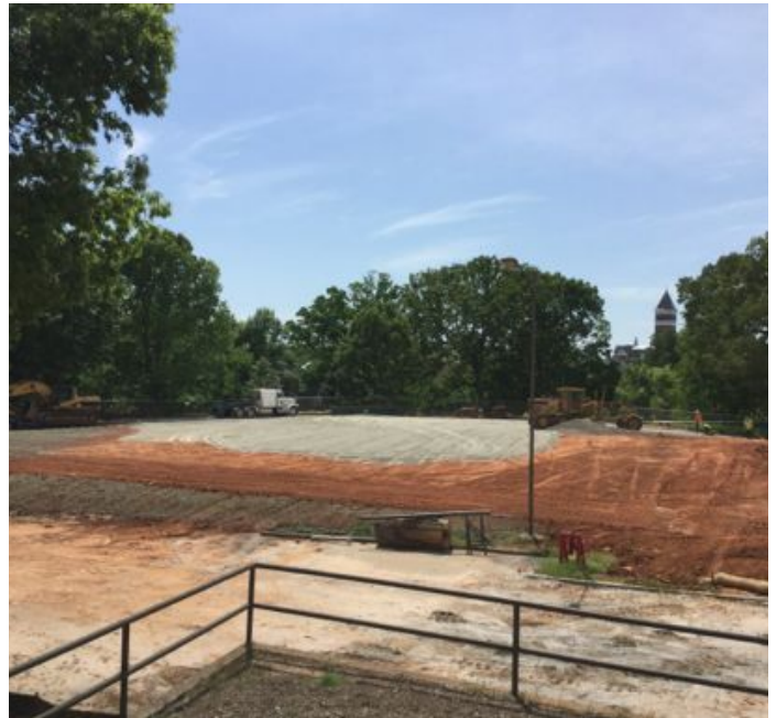
Holder Trailer Compound