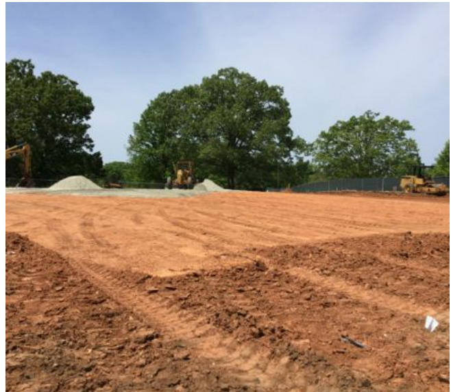
Began Grading Trailer Compound