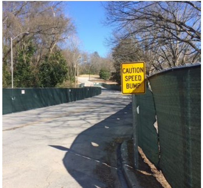
Speed Bump Signage