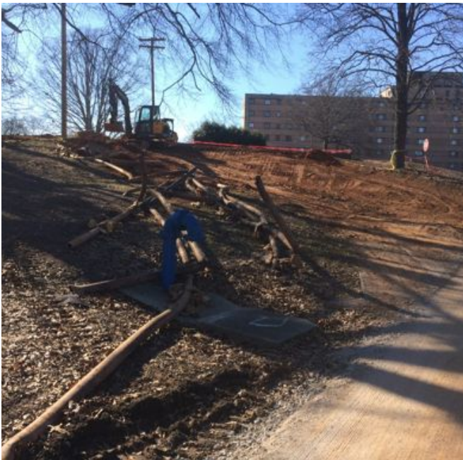
Steam Line Removal