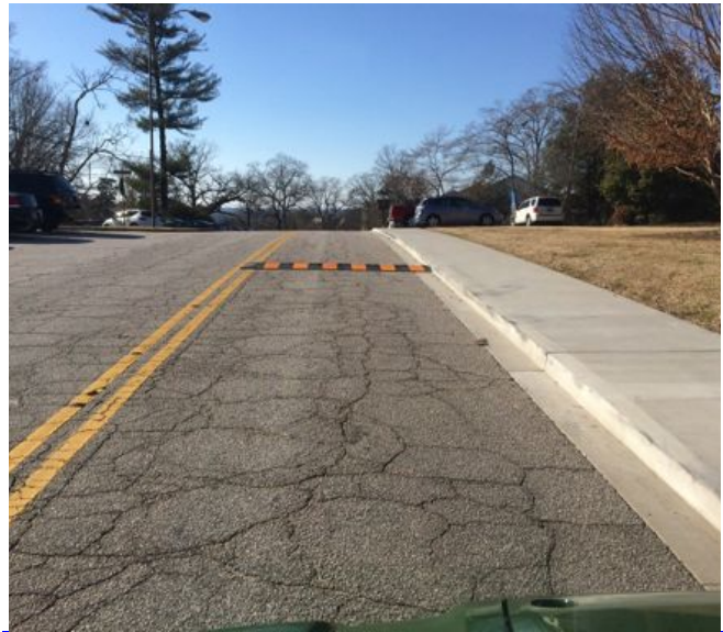
Began Speed Bump Installation Signage