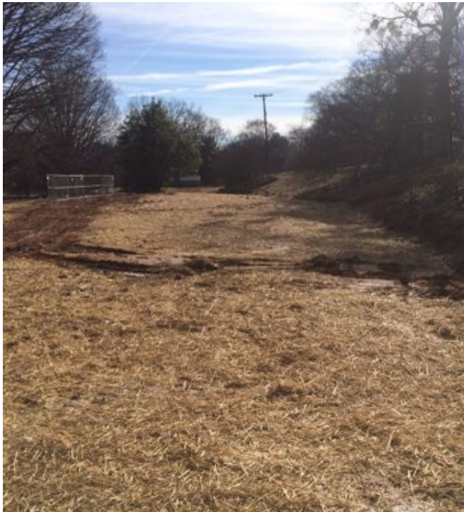
Completed Steam Line Removal SE of Tower