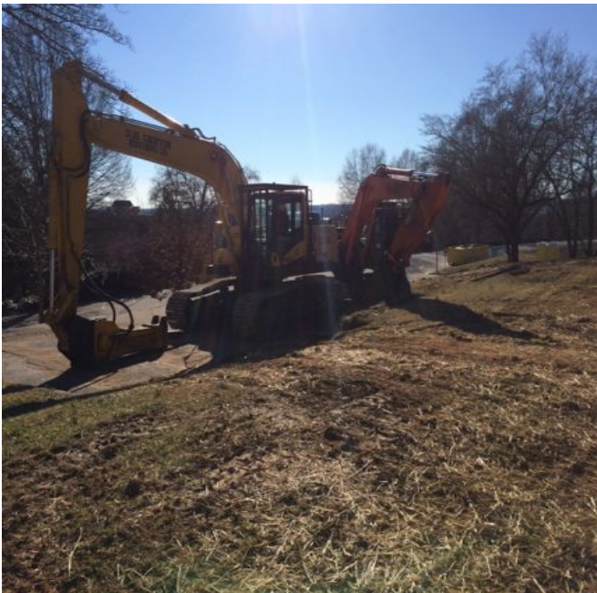
Mobilization of Foundation Removal Equipment