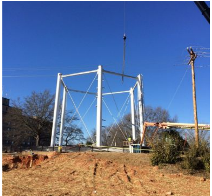
Continue Water Tower Demo