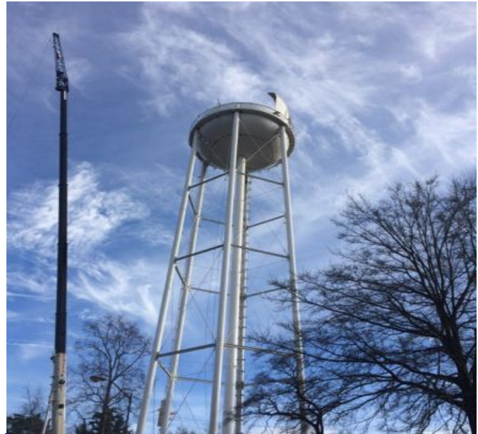
Continue Removal of Water Tower