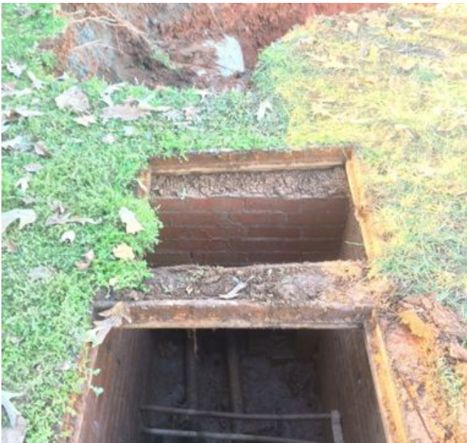
Steam Line Removal East of Tower