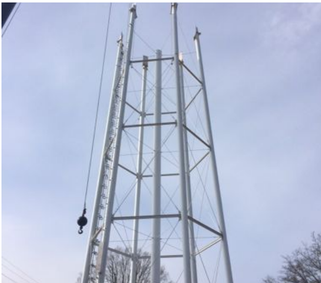
Begin Removal of Water Tower Risers