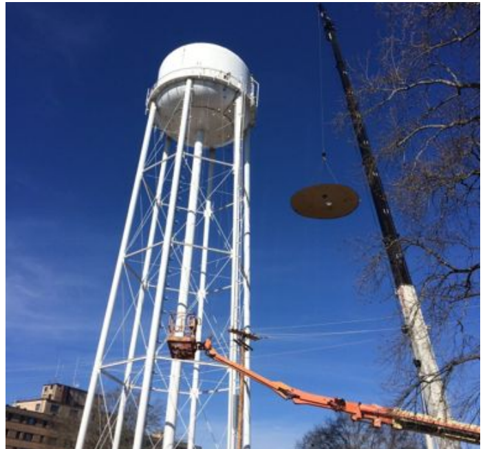
Began Water Tower Demo